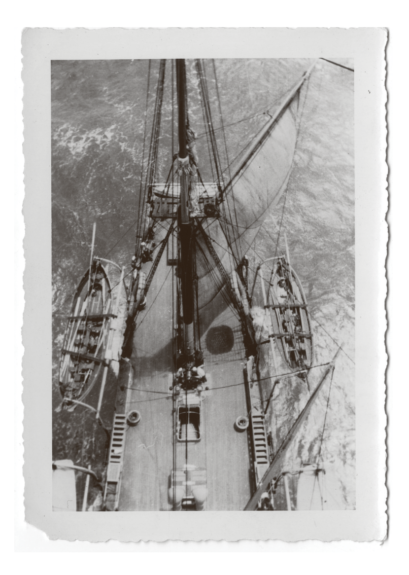
FIGURE 3 Photograph by Van Horne Morris with caption on the back that reads, "The Nantucket, 1937." Source: Personal collection of the author.