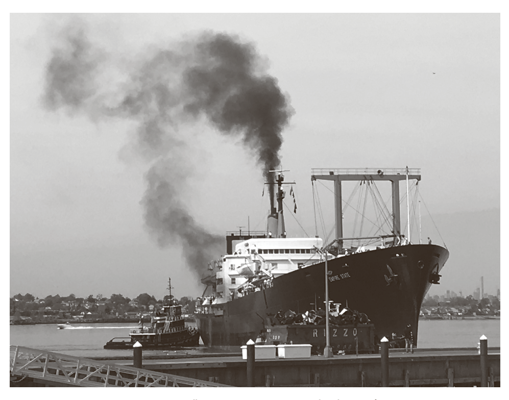
FIGURE 1 SUNY Maritime College's Empire State VI training ship, departing for summer sea term, May 2018.

In order to better understand these collections, in 2017, I enrolled in the college's graduate program in maritime and naval studies, which offers courses in maritime literature, history, music, and art. Through my coursework in the program, I began to make connections between primary sources in the archives and the tradition of American sea writing. When it came time to design my graduate capstone project, I decided to pursue a digital humanities project, transcribing and annotating first-hand accounts of maritime life. In order to contextualize these writings, I had to first understand the evolution of literary culture among sailors in the United States.