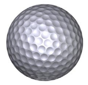
Figure 3: Solid Object Model