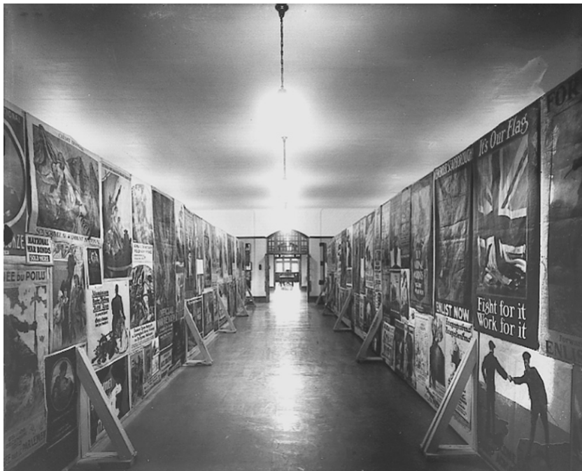
Figure Fourteen War Posters Room, Public Archives Building, Sussex Drive, Ottawa, Ontario, ca. 1927-30. NA, Public Works Collection (Acc. No. 1979-140), PA-137708.