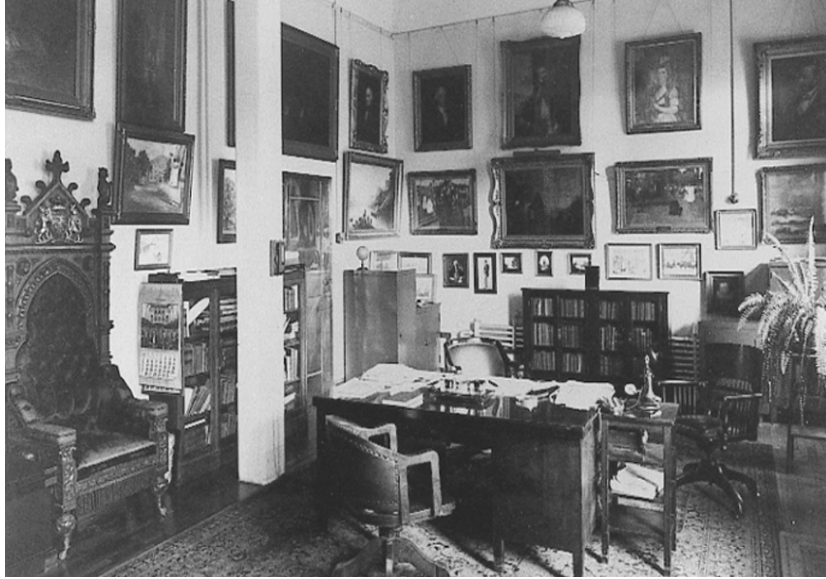
Figure Eleven Office of the Deputy Minister, looking southeast, Public Archives Building, Sussex Drive, Ottawa, Ontario, 1930.