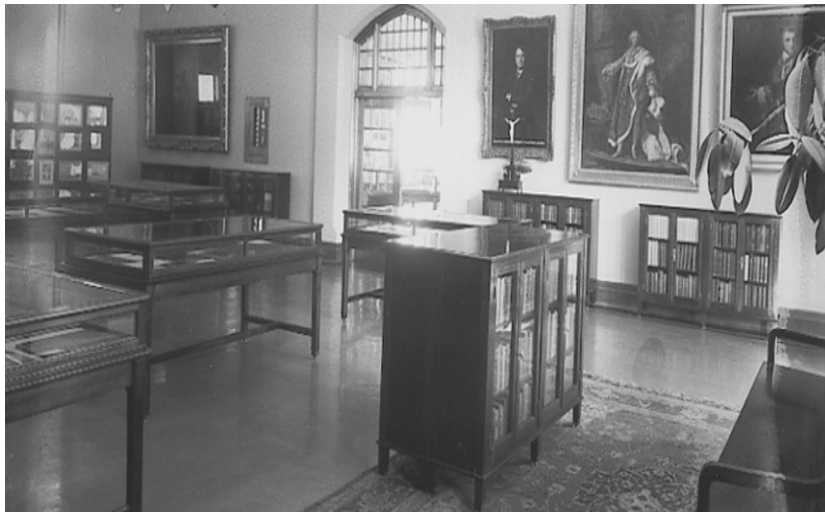
Figure Ten Northcliffe Room, Public Archives of Canada, Sussex Street, Ottawa, Ont. NA, Public Works Collection (Acc. No. 1979-140), PA-137718.