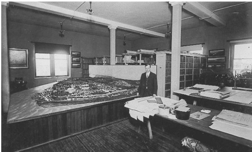
Figure Four The Quebec City Model (the Duberger Model) in the Public Archives of Canada, ca. 1910.