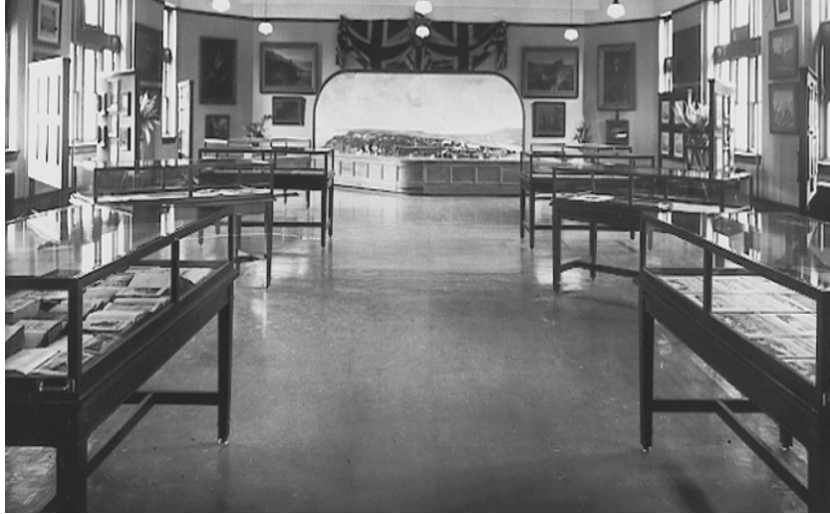
Figure Seven A view of Grey Room in the Public Archives Building, Sussex Drive, Ottawa, Ontario, ca. 1926-30. NA, Public Works Collection (Acc. No. 1979-140), PA-137716.