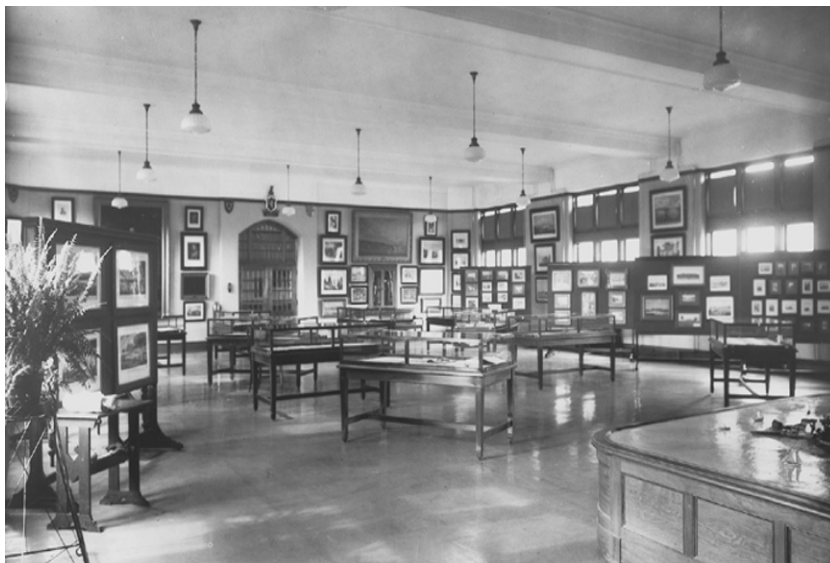
Figure Twelve Grey Room in the Public Archives Building, Sussex Drive, Ottawa, Ontario, ca. 1926-30.