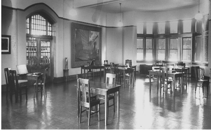
Figure Nine A Reading Room in the Public Archives Building, Sussex Street, Ottawa, Ontario, ca. 1925.