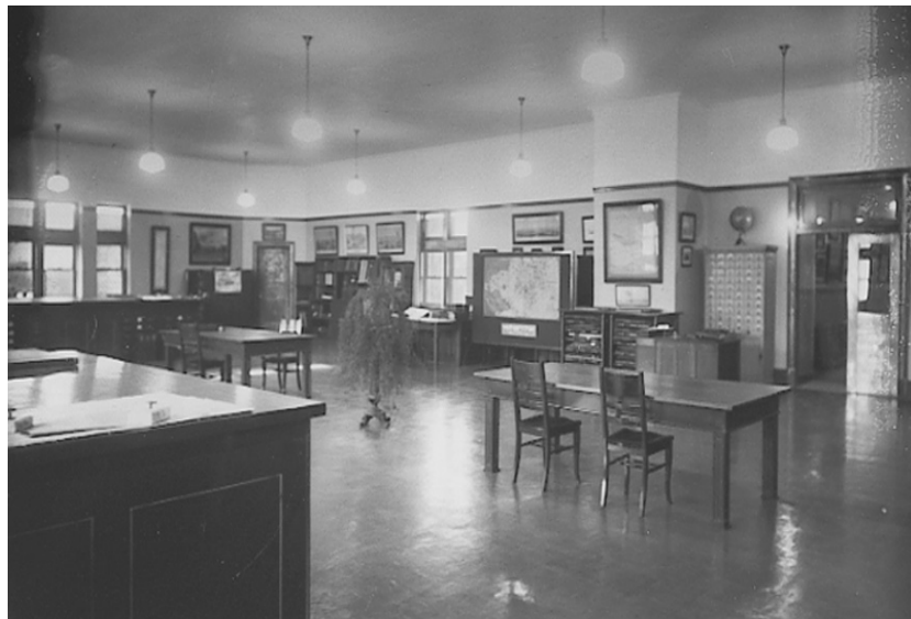
Figure Eight The Map Room in the Public Archives Building, Sussex Drive, Ottawa, Ontario, ca. 1926-1930.