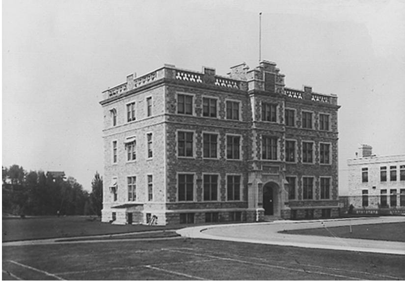
Figure Three The Public Archives Building, Sussex Drive, Ottawa, ca. 1910, showing the tennis court outside of the building, on which Doughty and his staff would occasionally challenge visiting scholars to a match on summer afternoons. NA, W.J. Topley Fonds (Acc. No. 1936-270), PA-12619.