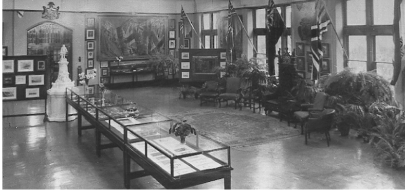
Figure Thirteen Minto Room, Public Archives of Canada, Ottawa, Ontario, arranged for reception to delegates for the Imperial Conference, Aug. 1932. NA, Public Works Collection (Acc. No. 1979-140), PA-137714.