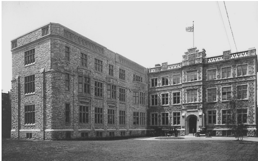
Figure Sixteen Public Archives of Canada, showing the 1925 addition.