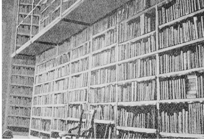
Figure One In the Archive Rooms. Published in the Canadian Magazine 16 (January 1901), p. 207.